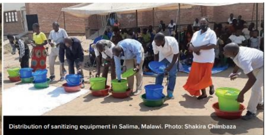
Distribution of sanitizing equipment in Salima, Malawi.