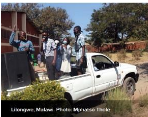
Lilongwe, Malawi.